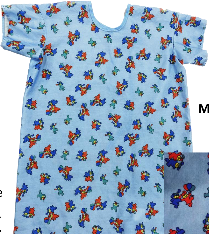
Medium Pediatric Gown

Gown, pediatric, Medium, 100% polyester inherently flame retardant to meet all currently existing Federal Flammability Regulations. Juvenile print on blue background, center back opening, self-fabric ties, 23½" Length, 33½" sweep"