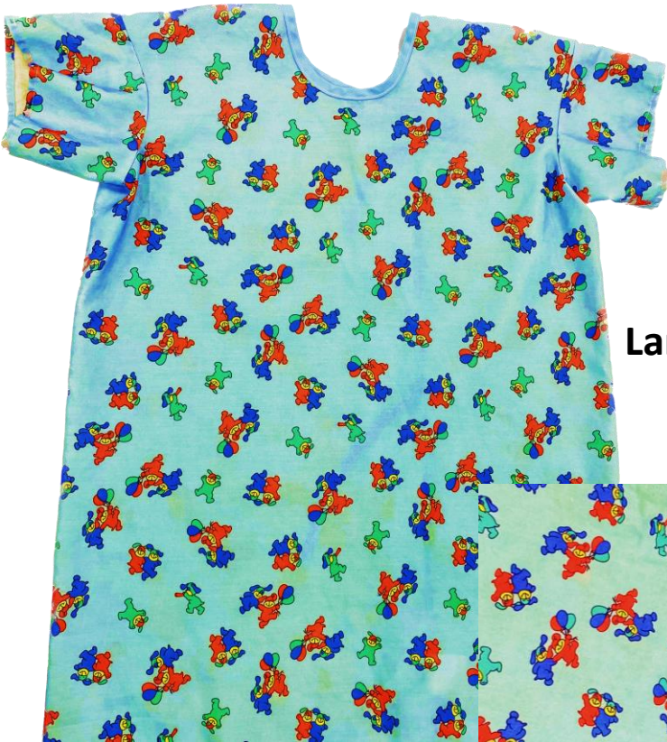
Large Pediatric Gown

Gown, pediatric, Large, 100% polyester inherently flame retardant to meet all currently existing Federal Flammability Regulations. Juvenile print on green/aqua background, center back opening, self-fabric ties, 25½" Length, 37" sweep