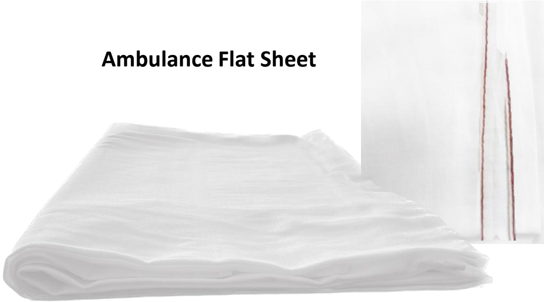
Ambulance Flat Sheet