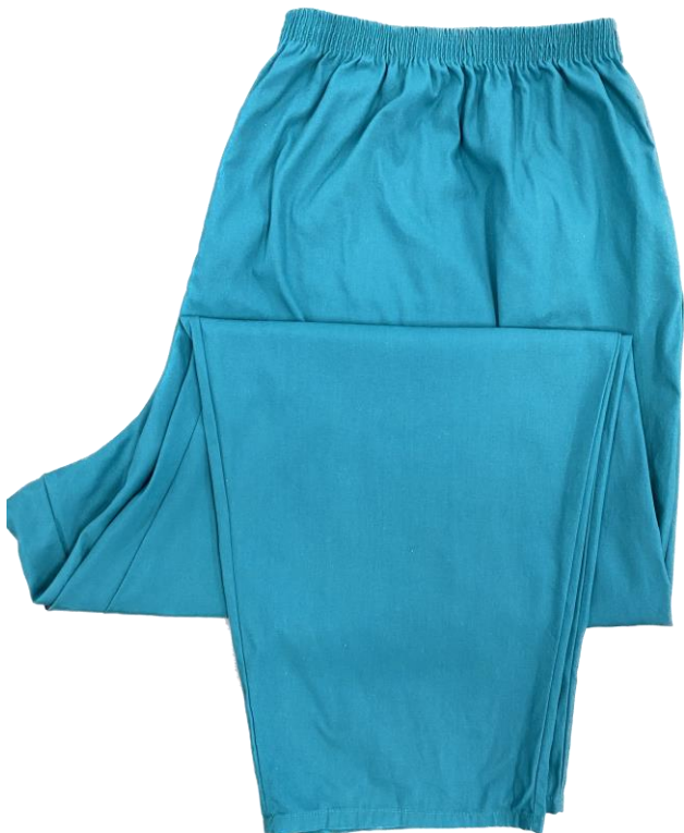
5XL Pajama Bottom

Pajama bottom, Adult, 3XL, 35% Cotton/65% Polyester blend, vat dyed navy blue, elastic waist, pocket on both hips, 38"-54" waist, No fly opening.