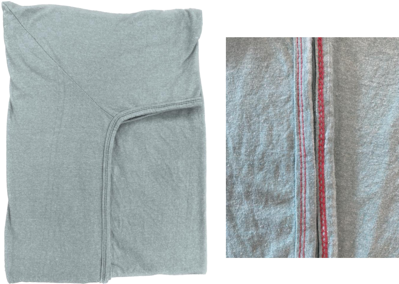
Fitted Stretcher Sheet

Sheet, bed, fitted, knit, white (available in bags of 5 sheets), 100% spun polyester, 24 oz. 36" X 84" X 14". White w/ Teal Hem Thread, Performax