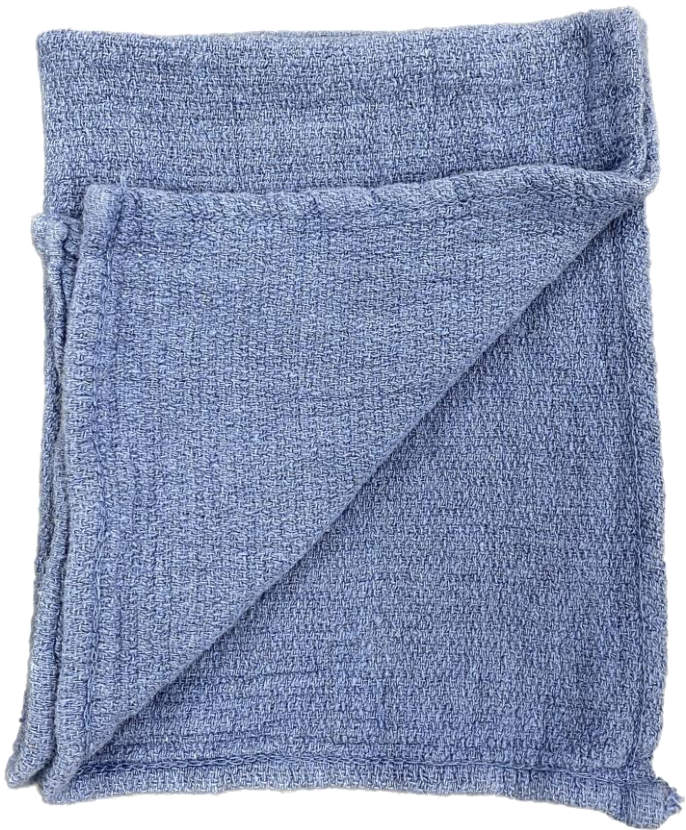
Blue Towel Rag

Towel, surgery, 100% cotton, absorbent weave, misty green, hemmed both ends or 4 hemmed edges. 18” x 33”