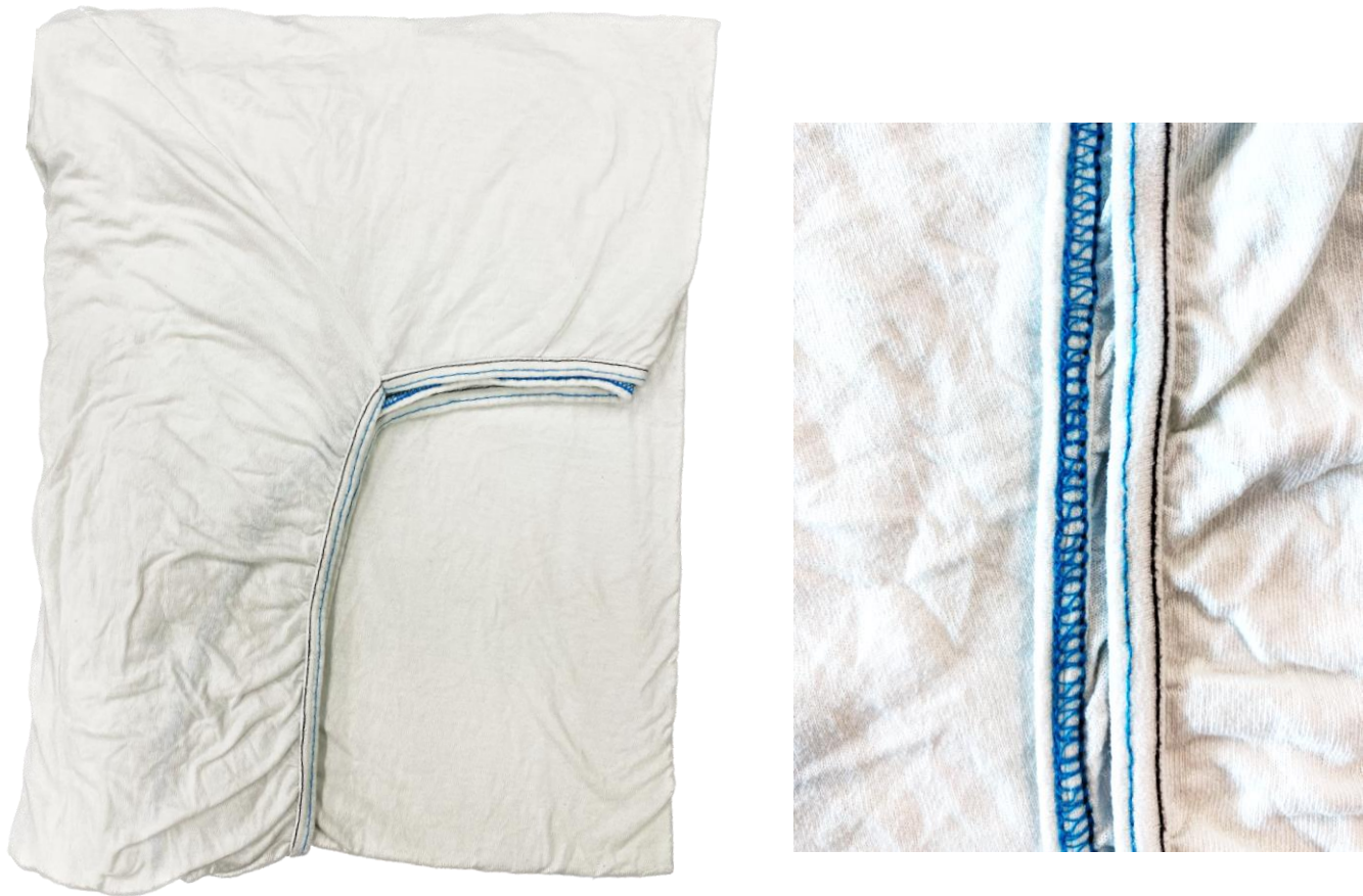
Fitted Bed Sheet