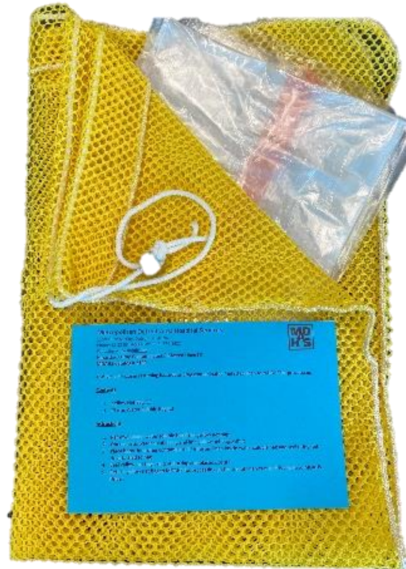
Infested Linen Kit