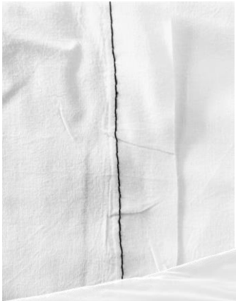
Flat Draw Sheet