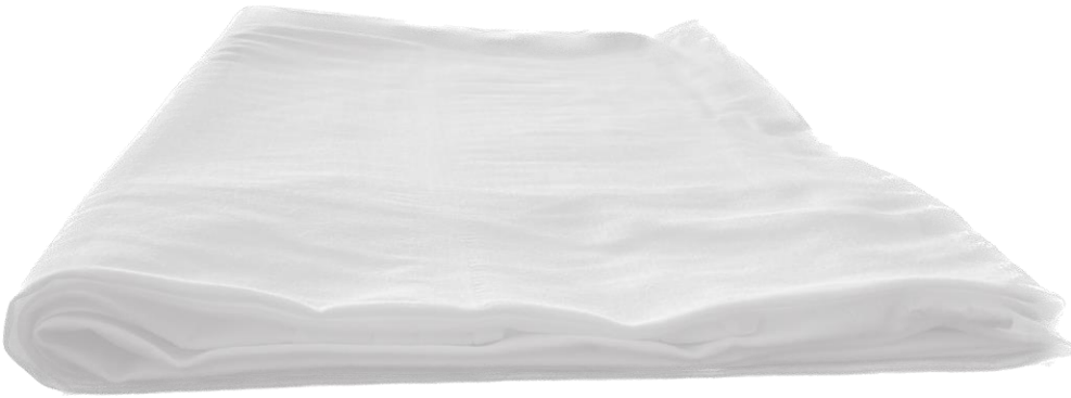
Flat Bed Sheet

Sheet, bed, flat, white, T-180, 55/45 cotton/polyester, 66" X 115", 1" hems both ends.