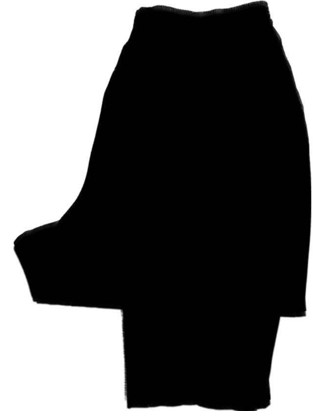
5XL Pajama Bottom

Pajama bottom, Adult, 3XL, 35% Cotton/65% Polyester blend, vat dyed navy blue, elastic waist, pocket on both hips, 38"-54" waist, No fly opening.