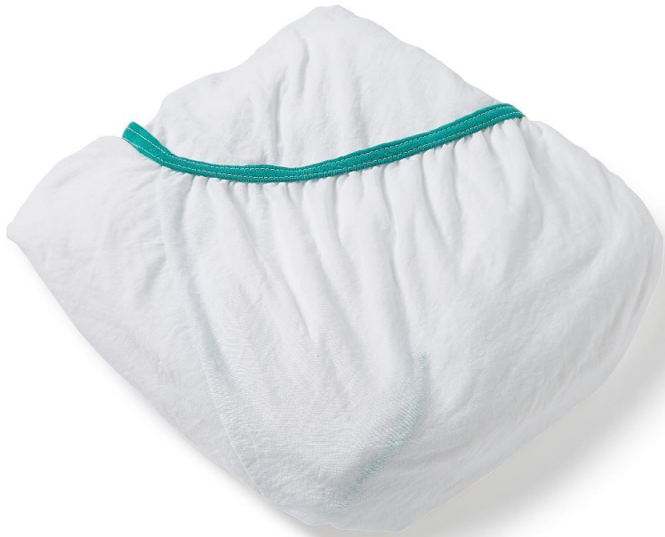
Fitted Bed Sheet