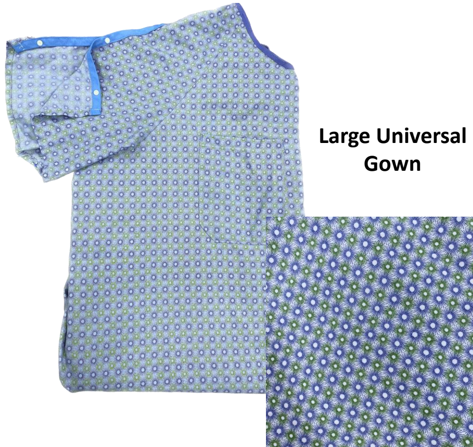
Large Universal Gown