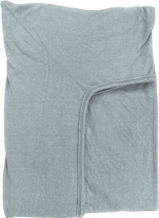
Fitted Stretcher Sheet