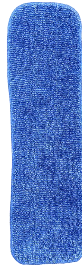
Microfiber Mop Pad

Mophead, 16 oz., radial flared, taped and looped ends, 1/3 cotton/1/3 polyester/1/3 nylon, 5-inch nylon mesh covered center band. Entire mophead to be medium green in color.