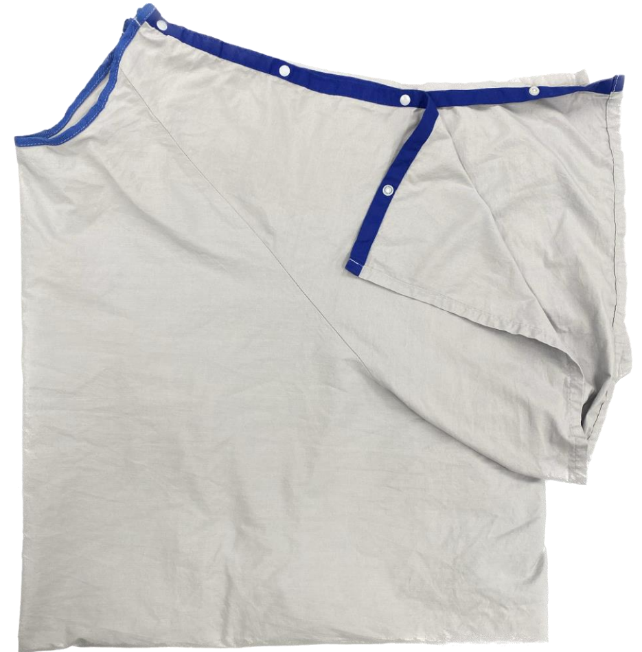
3XL-5XL Safety Gown

Safety Gown, Large, Fashion Blend 55% Cotton/45% Polyester, Full Back with Plastic Snaps