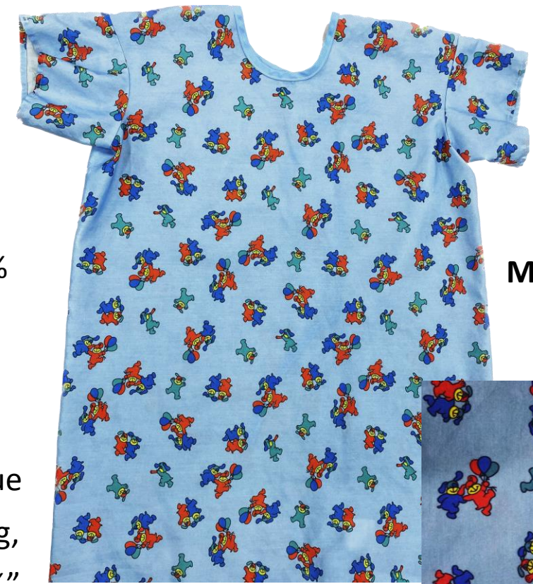
Medium Pediatric Gown

Gown, pediatric, Medium, 100% polyester inherently flame retardant to meet all currently existing Federal Flammability Regulations. Juvenile print on blue background, center back opening, self-fabric ties, 23½" Length, 33½" sweep"