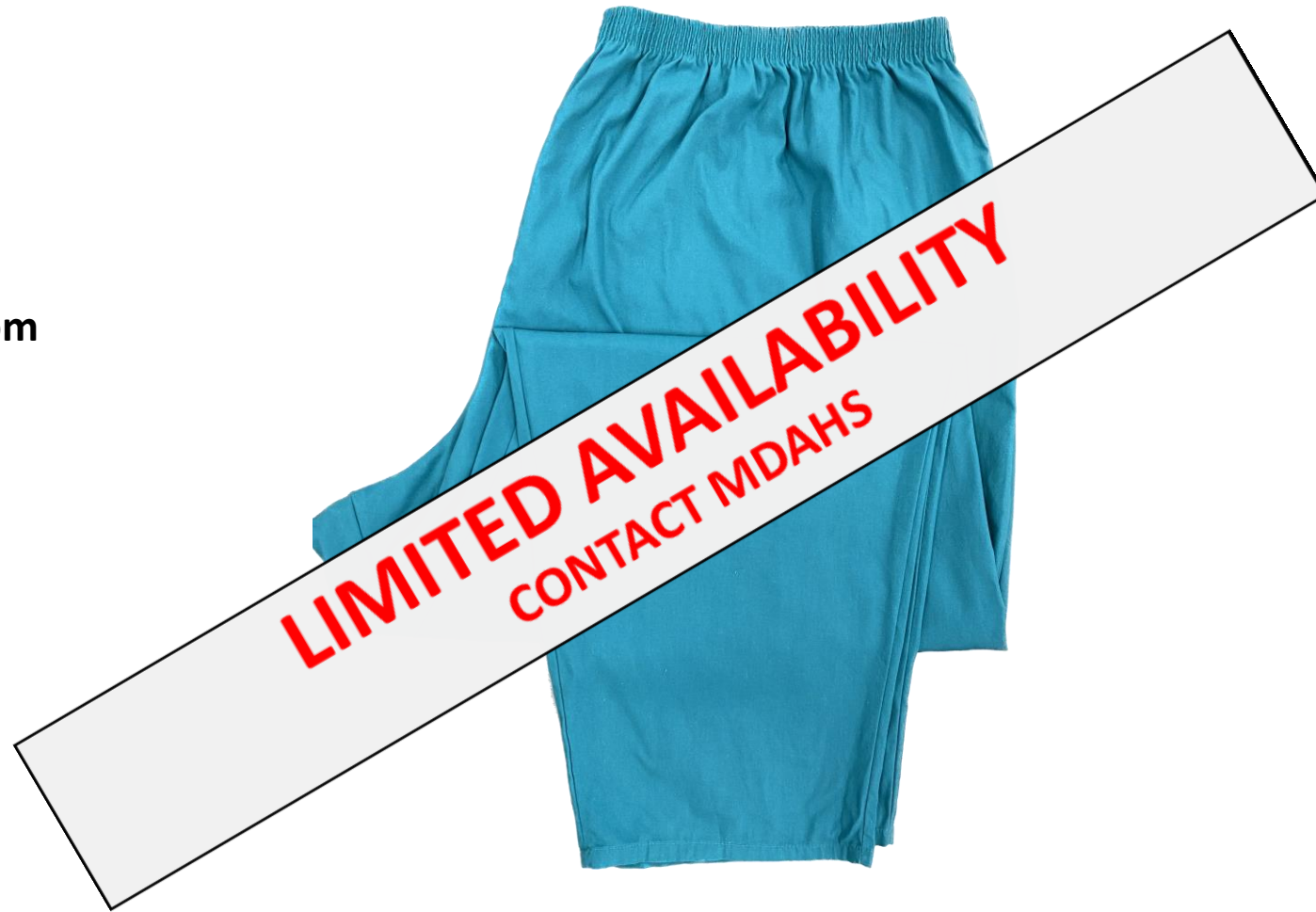
5XL Pajama Bottom