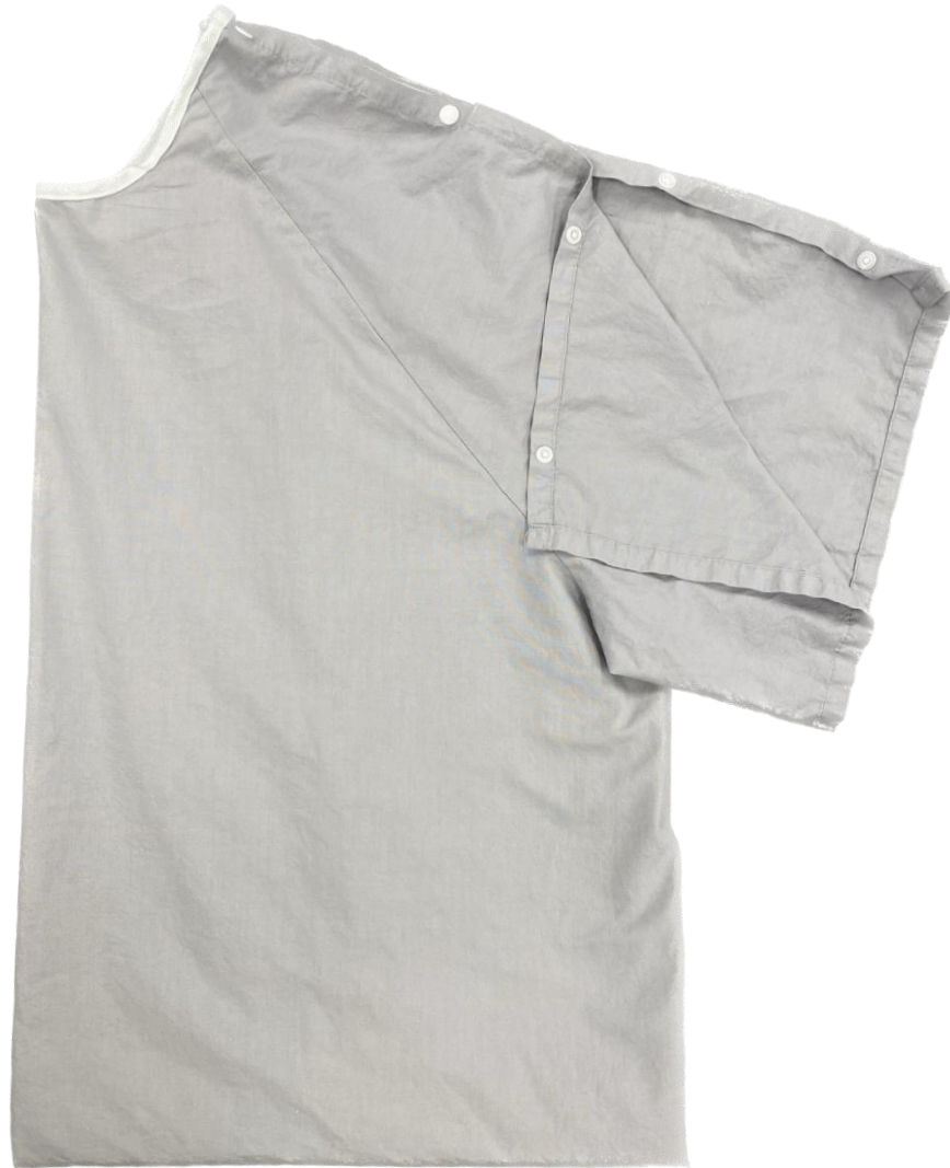
Large Safety Gown