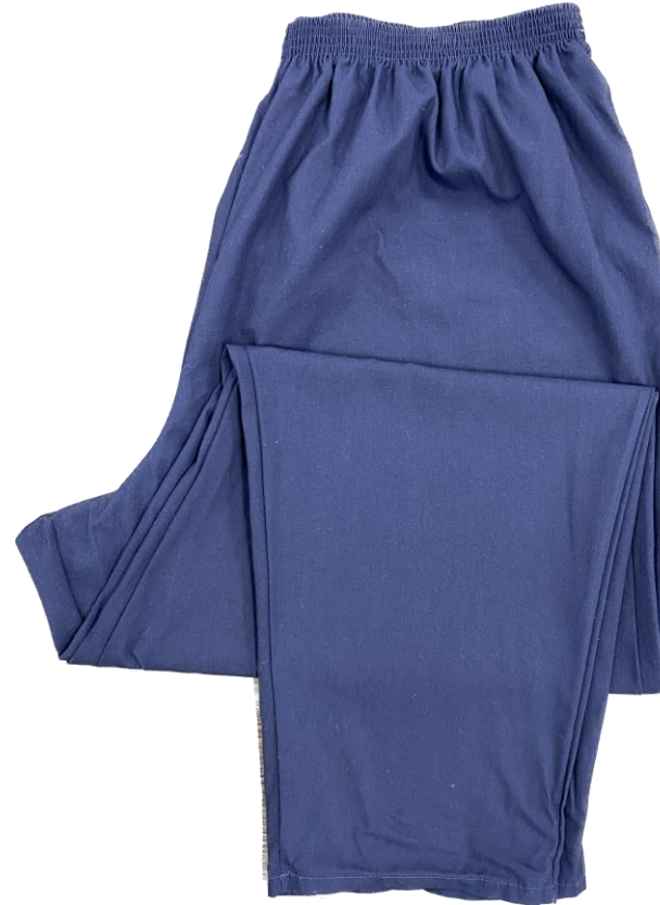
3XL Pajama Bottom

Pajama bottom, Adult, LG/XL, 35% Cotton/65% Polyester blend, vat dyed ceil blue, elastic waist, pocket on both hips, 32"-46" waist, No fly opening.