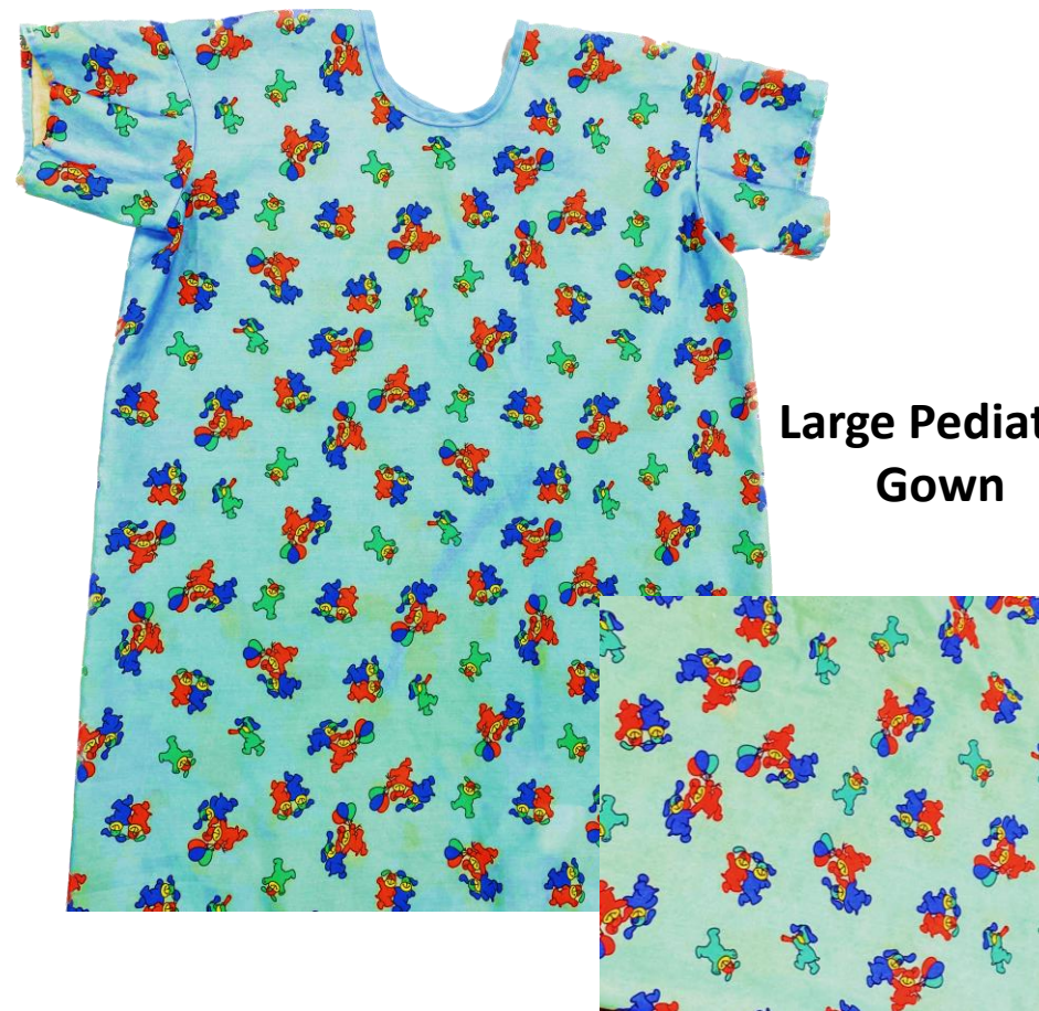
Large Pediatric Gown

Gown, pediatric, Large, 100% polyester inherently flame retardant to meet all currently existing Federal Flammability Regulations. Juvenile print on green/aqua background, center back opening, self-fabric ties, 25½" Length, 37" sweep