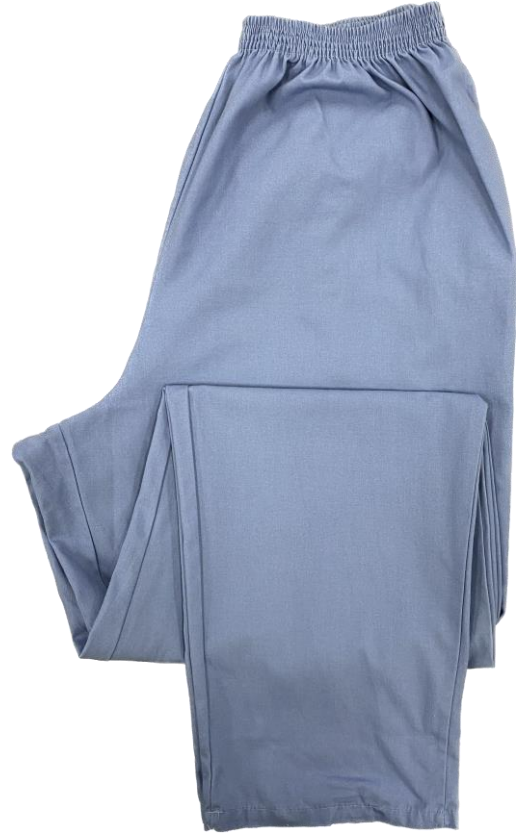
Large Pajama Bottom