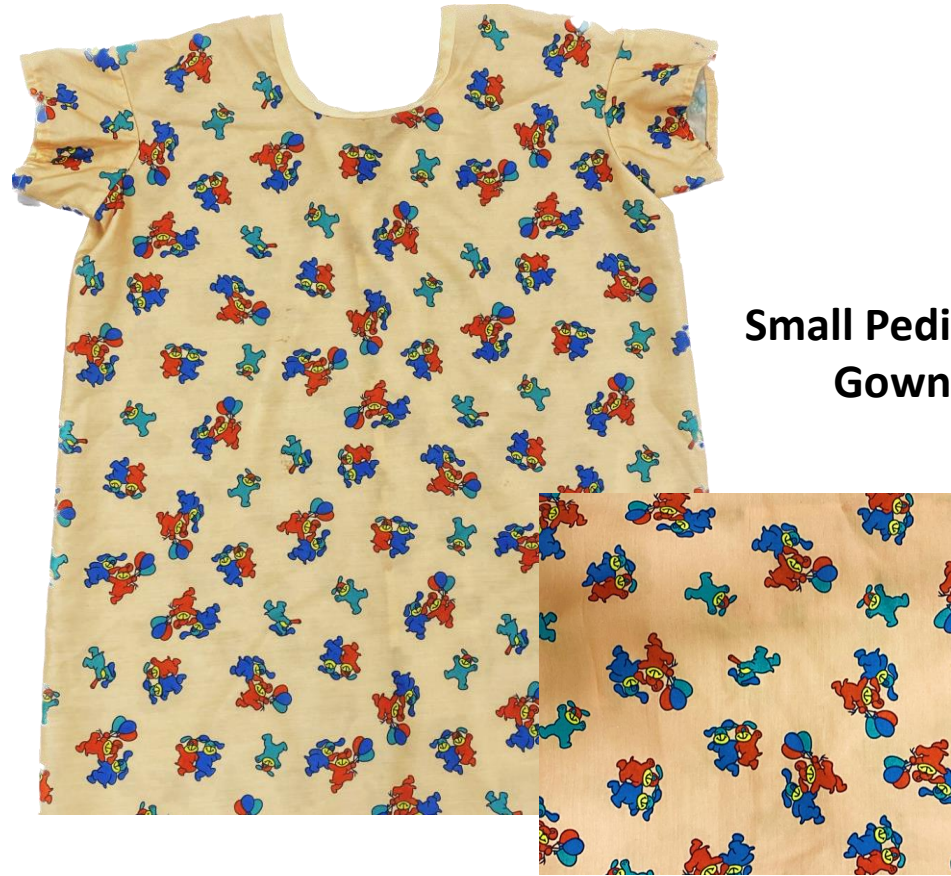
Small Pediatric Gown