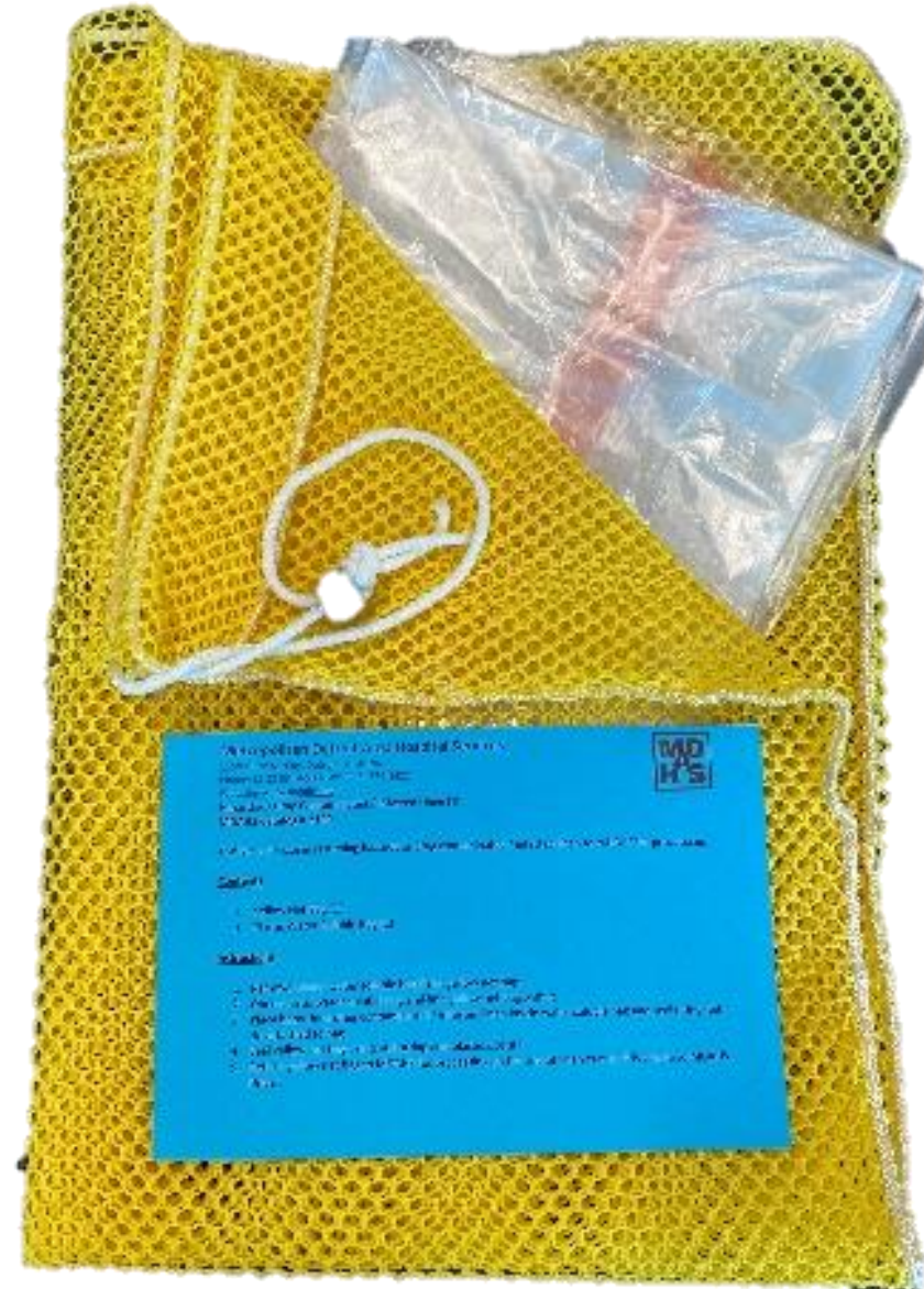
Infested Linen Kit