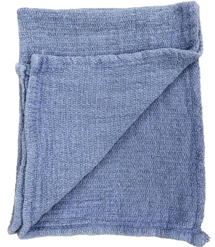
Blue Towel Rag

Towel, surgery, 100% cotton, absorbent weave, misty green, hemmed both ends or 4 hemmed edges. 18" x 33"