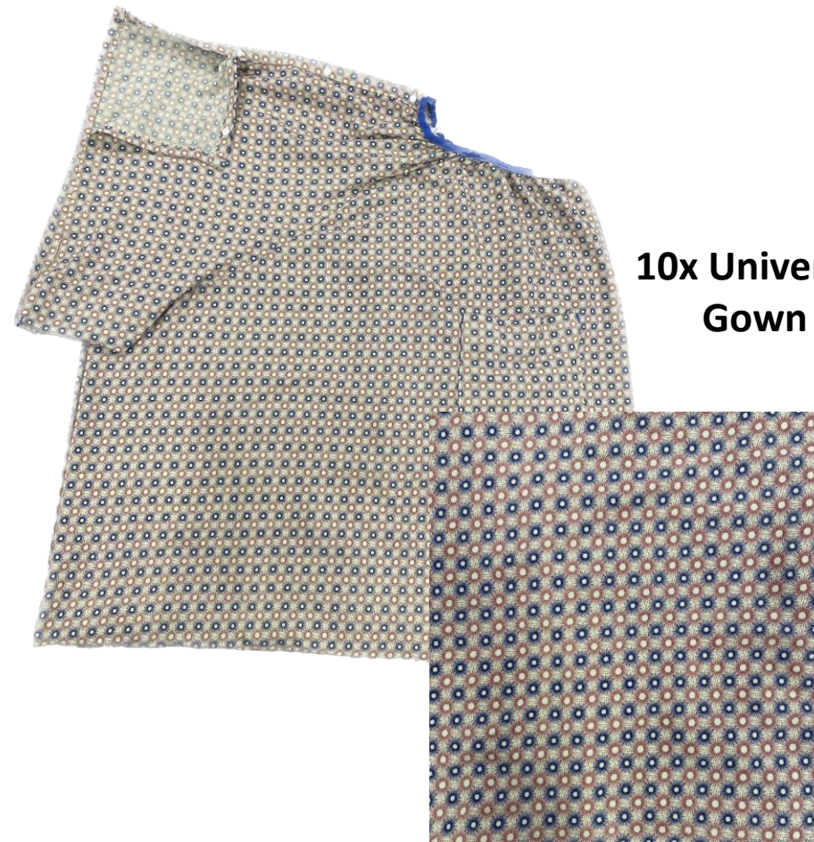
10x Universal Gown